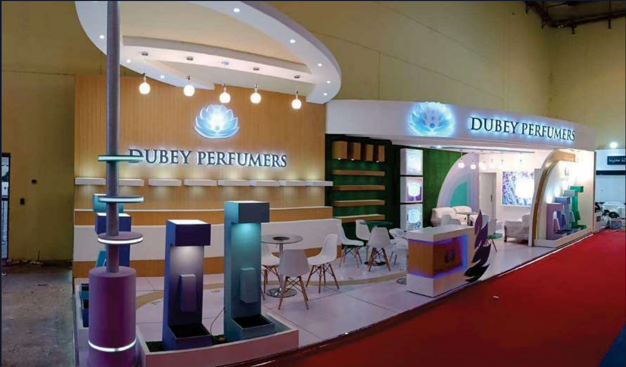
DUBEY PERFUMERS BEAUTY EXPO CAIRO EGYPT 2019