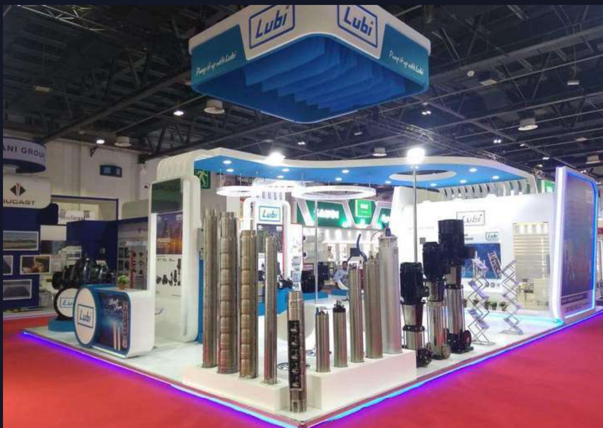
LUBI PUMPS BIG 5 2019, DUBAI