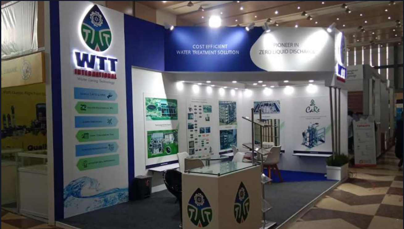
WTT INTERNATIONAL DTG BANGLADESH 2023