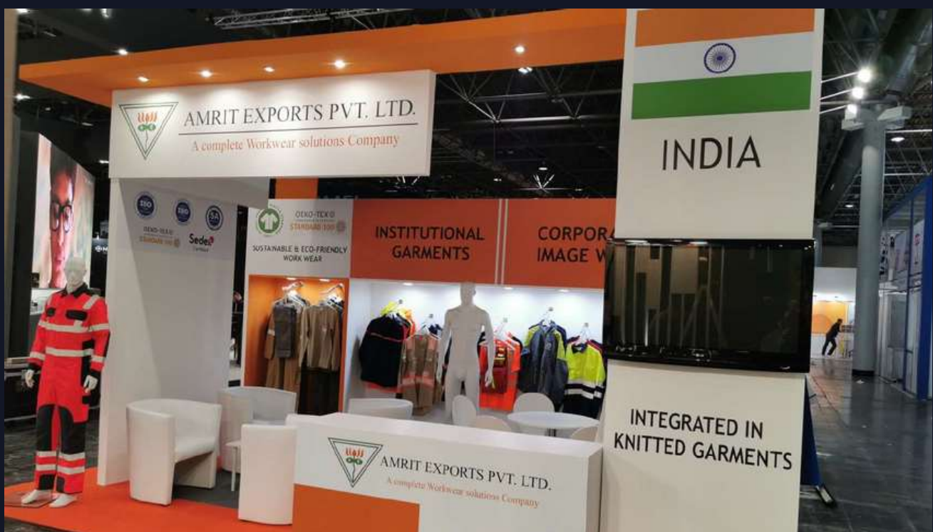
AMRIT EXPORTS A+A 2021 DUSSELDORF GERMANY