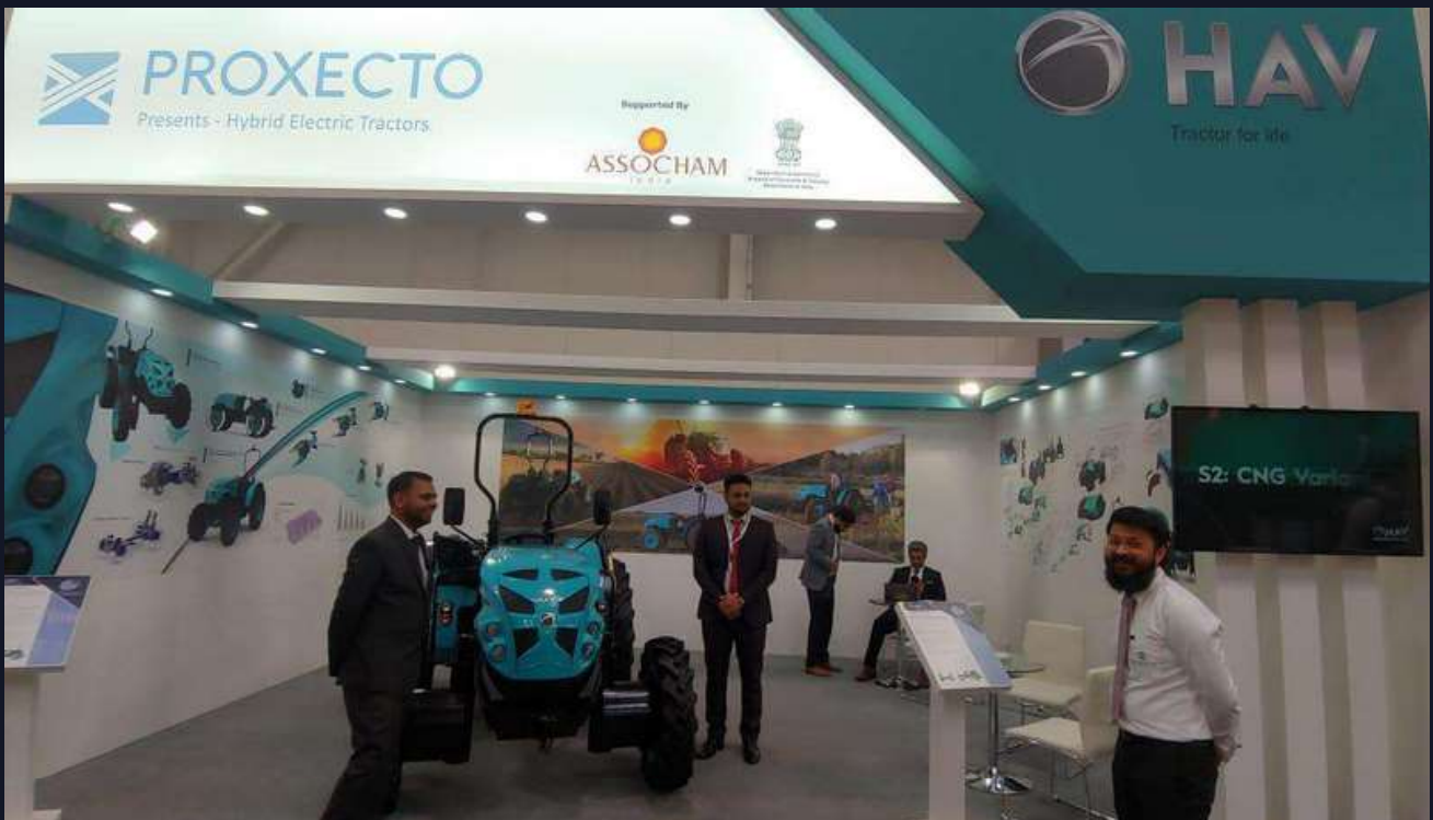
PROXECTO, AGRITECHNIKA 2019 HANOVER