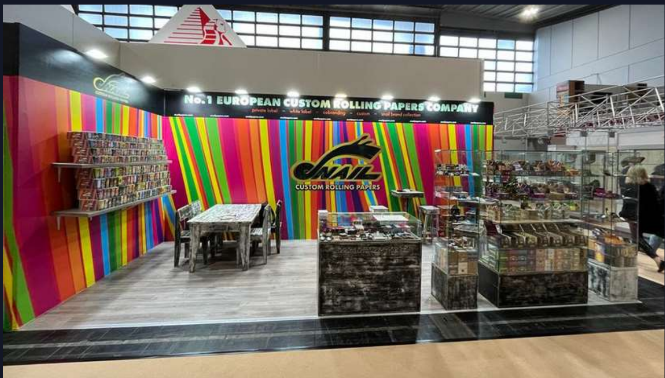
SNAIL CUSTOM ROLLING PAPERS INTERTABAC 2023, DORTMUND, GERMANY