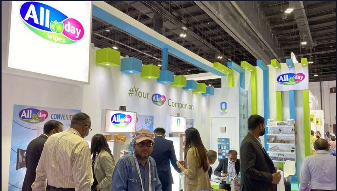
QUALITY WIPES BEAUTYWORLD ME 2021 DUBAI