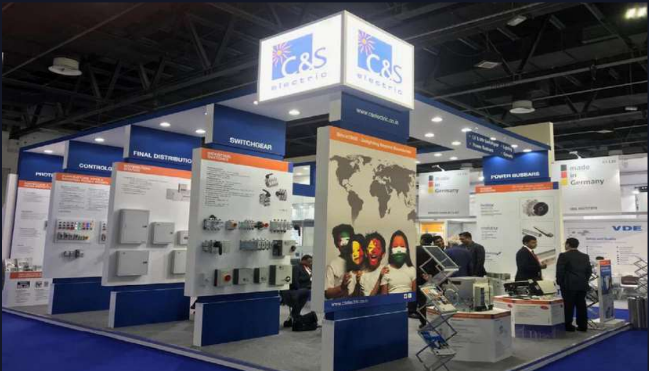
C & S ELECTRIC MEE 2019, DUBAI