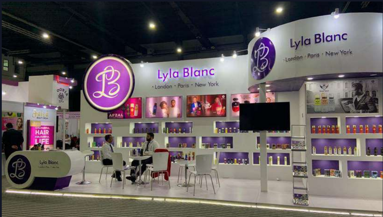
LYLA BLANC BEAUTY WEST 2019 AFRICA LAGOON NIGERIA