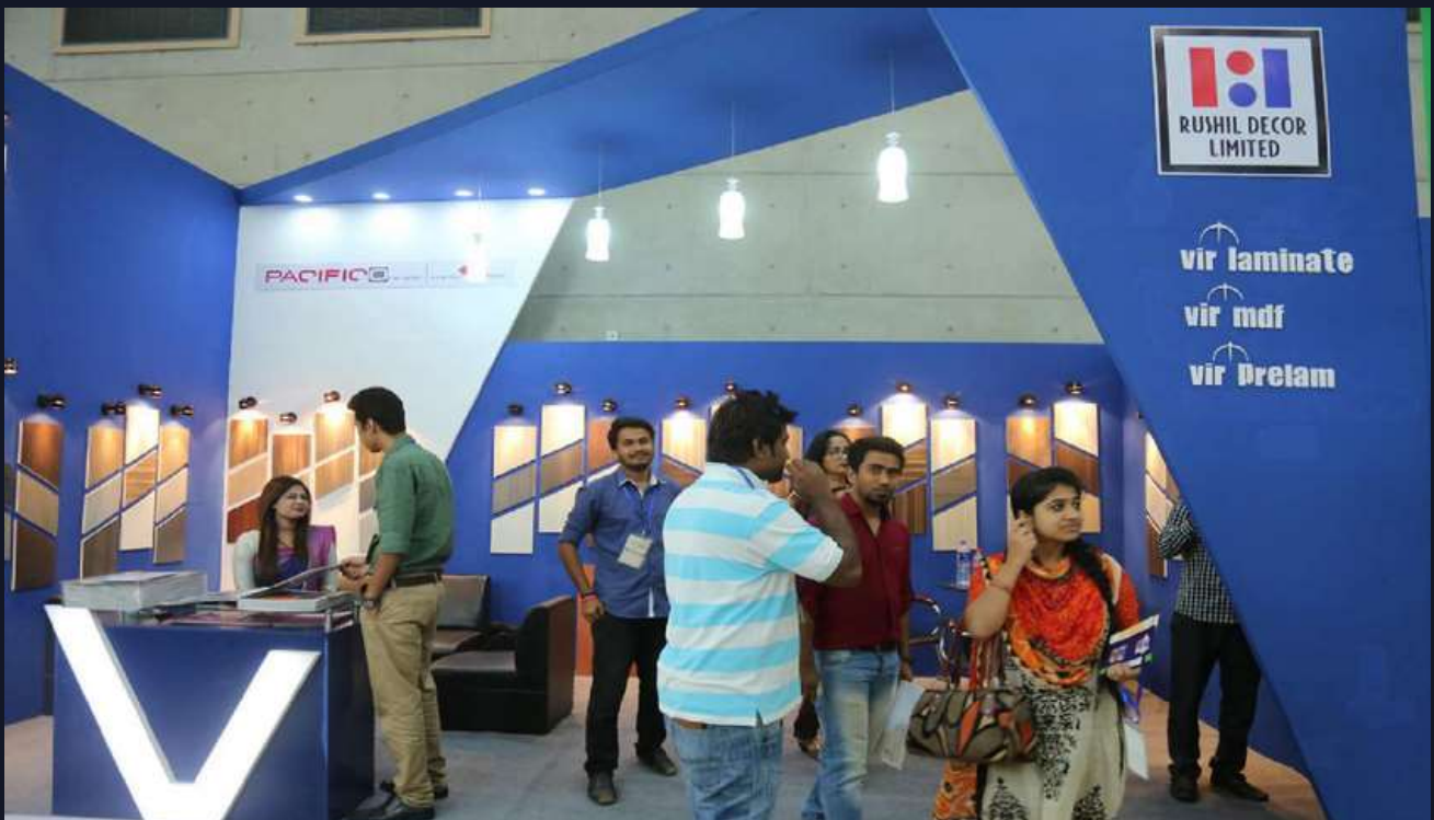
RUSHIL DECOR LTD. BANGLADESH WOOD SHOW, 2015