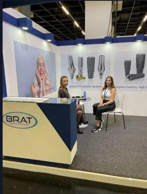
BRAT IMPLANTS IDS COLOGNE, GERMANY