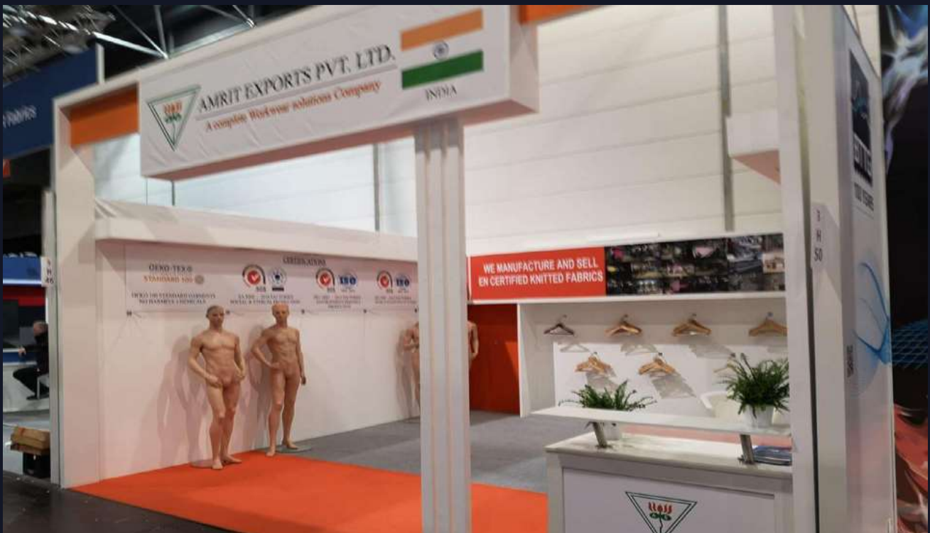
AMRIT EXPORTS, A+A 2019 GERMANY