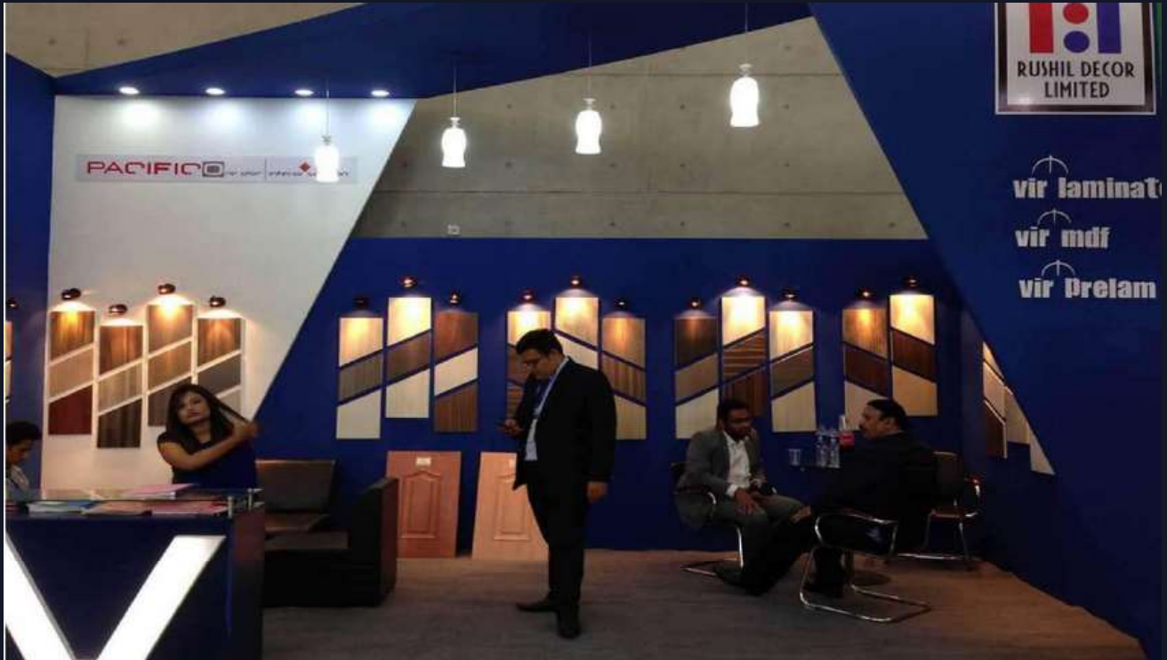
RUSHIL DECOR LTD. BANGLADESH WOOD SHOW, 2015