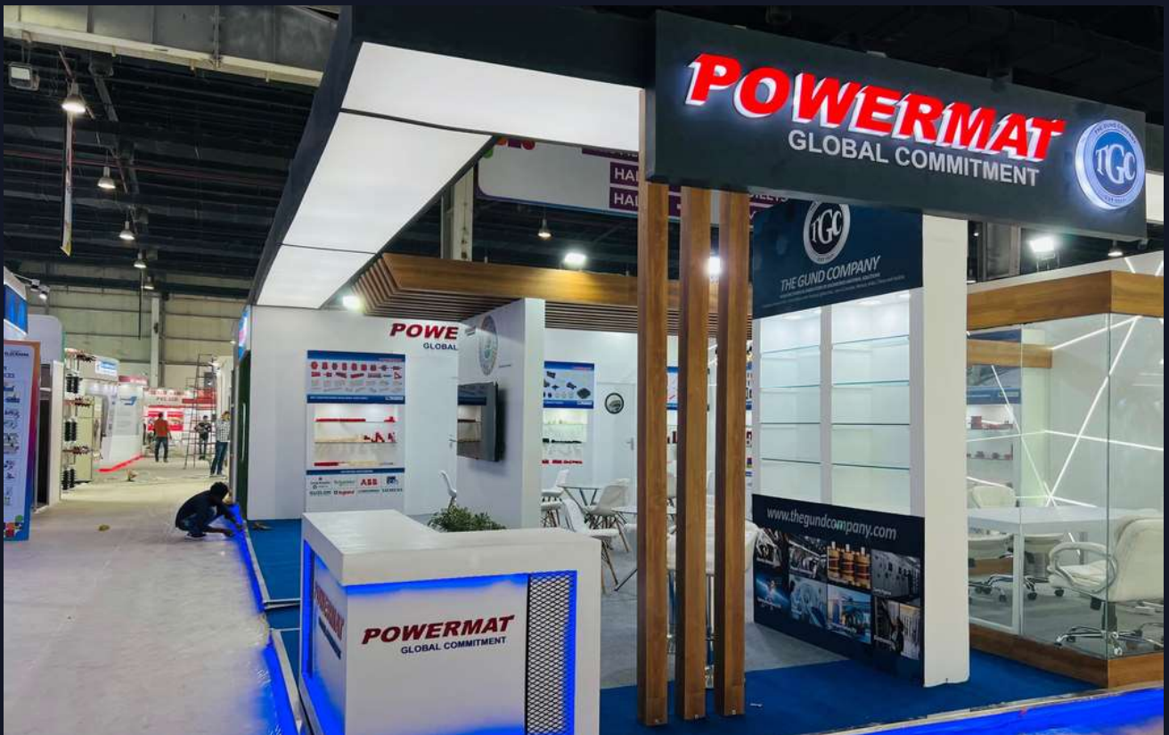
POWERMAT BIG 5 2019, DUBAI