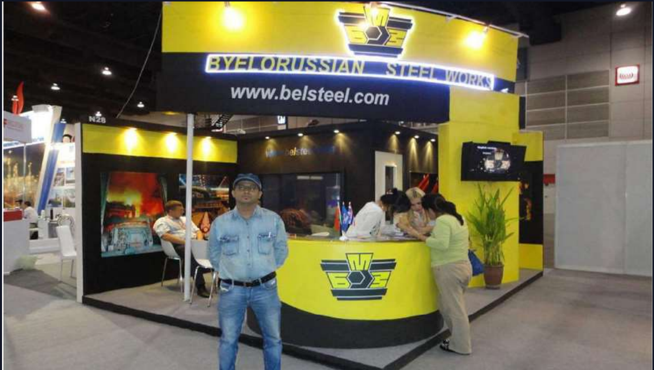
BELLO RUSSIAN STEEL WORKS WIRE 2013, THAILAND