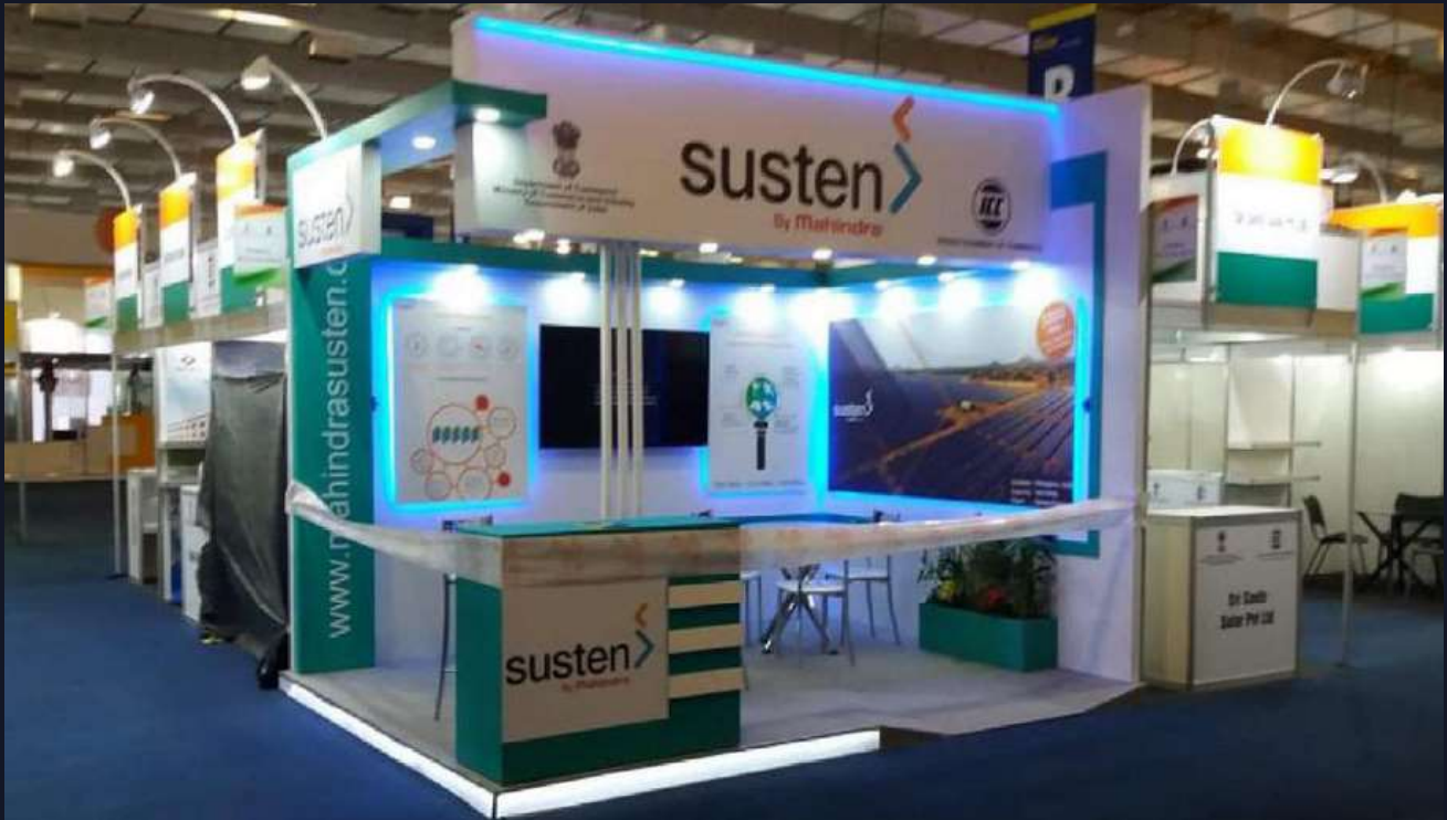
MAHINDRA SUSTEN INTER SOLAR 2018, SAO PAULO, BRAZIL