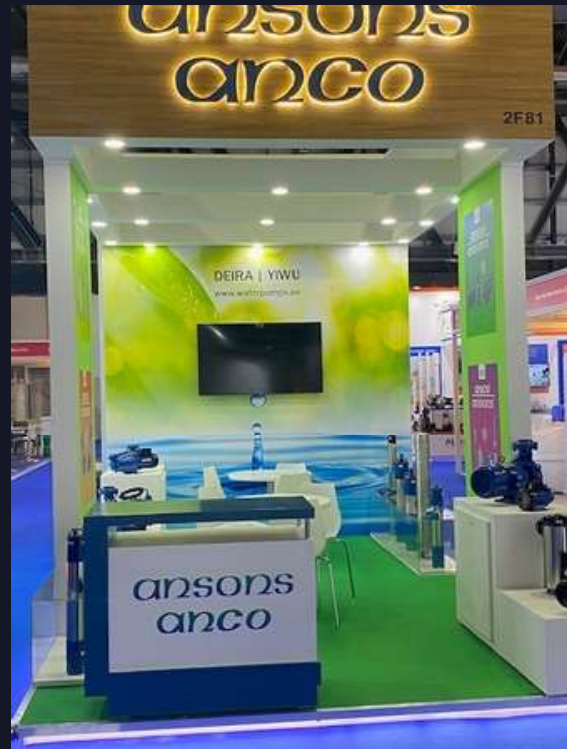
ANSONS ANCO BIG 5 2019, DUBAI