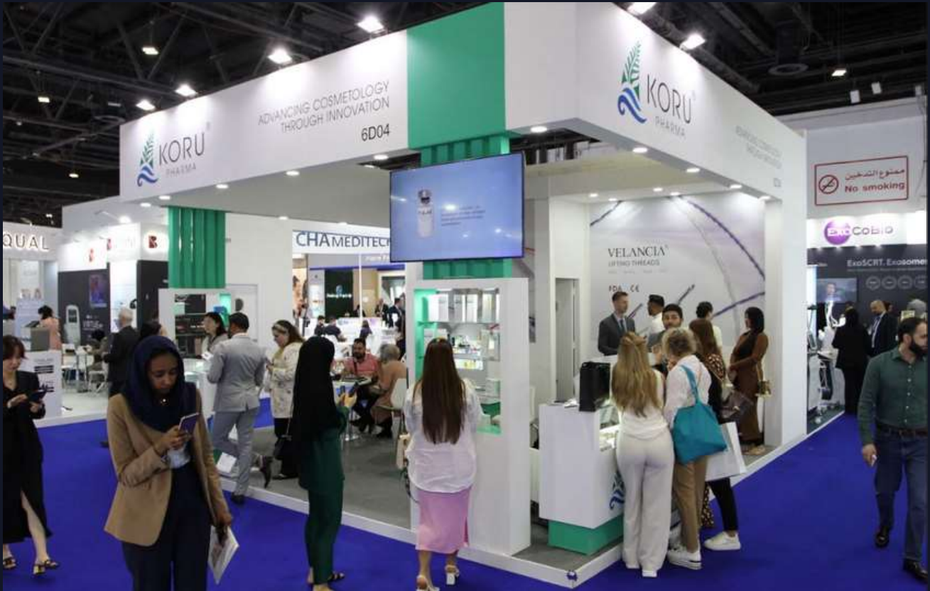
KORU PHARMA DUBAI DERMA 2023