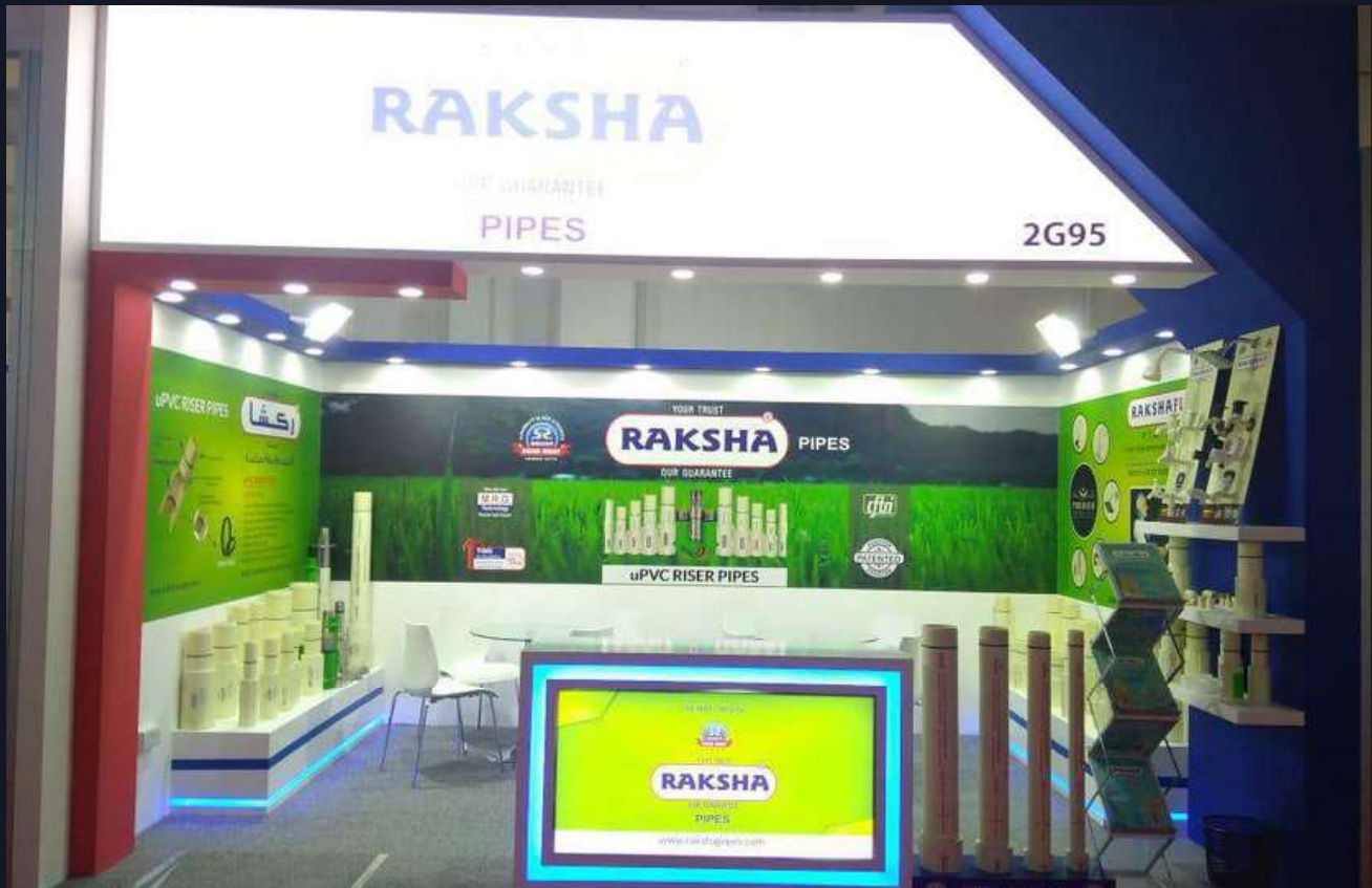
RAKSHA PIPE BIG 5 2019, DUBAI