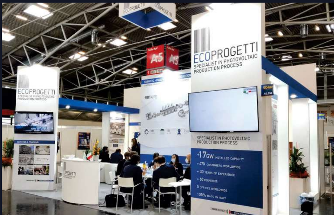
ECOPROGETTI INTERSOLAR EUROPE 2021 MUNICHEN GERMANY