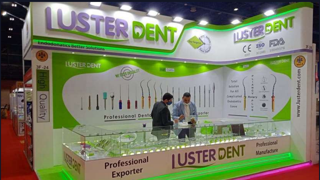
LUSTER DENT AEEDC 2021, DUBAI