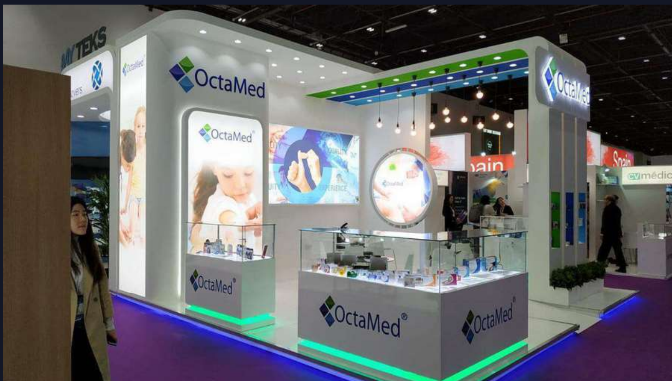
OCTAMED ARAB HEALTH 2020, DUBAI