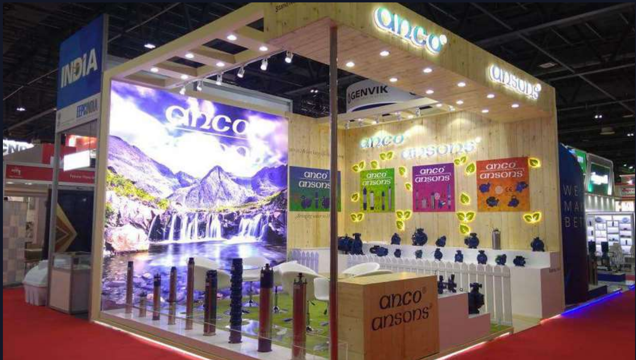
ANCO ANSON BIG 5 2019, DUBAI