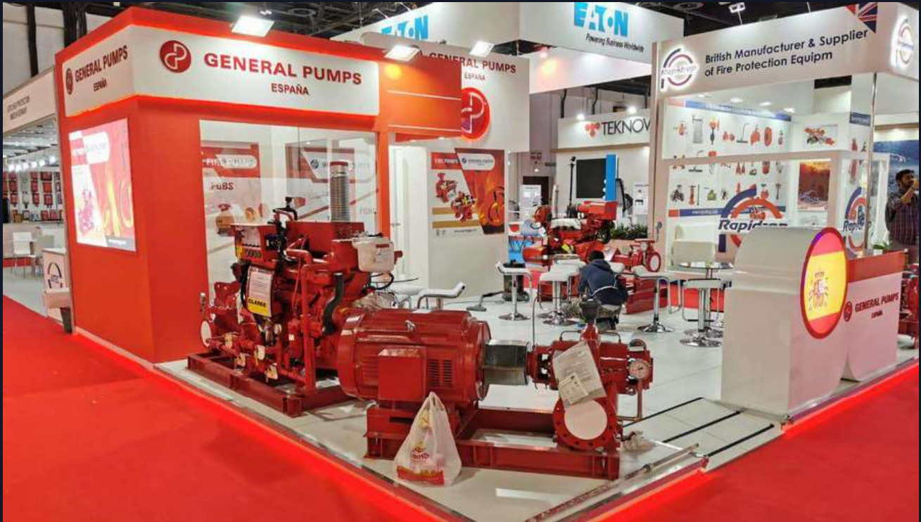
GENERAL PUMPS INERSEC 2020, DUBAI