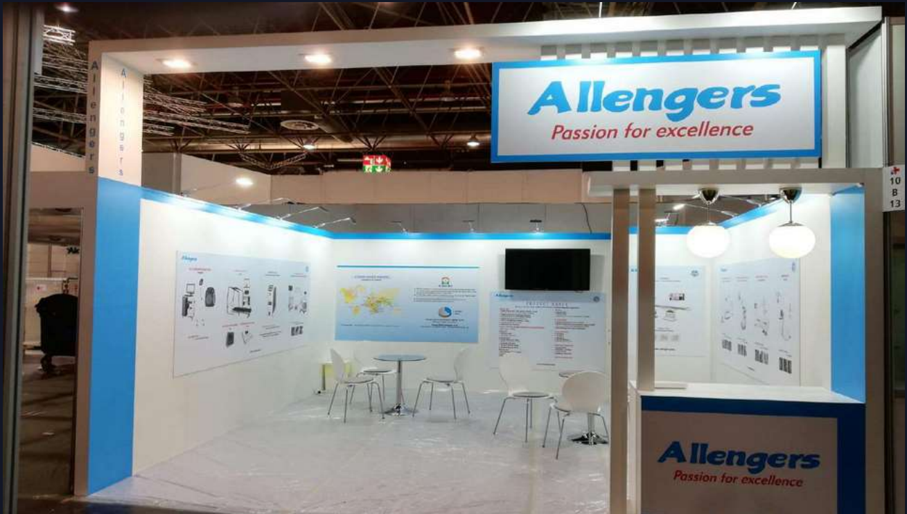
ALLENGERS, MEDICA 2019 GERMANY