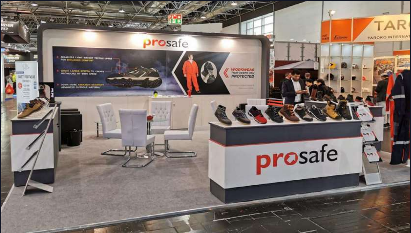
PROSAFE A+A 2019, GERMANY