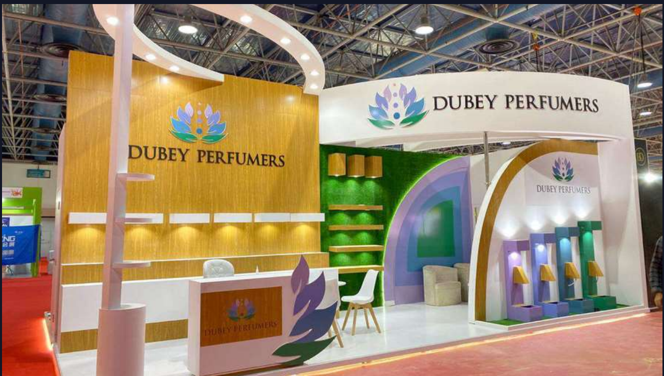
DUBEY PERFUMERS BEAUTY WORLD, SAUDI ARABIA 2019, DUBAI