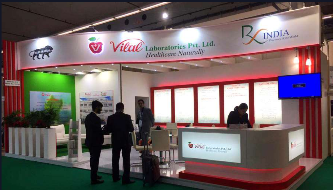
VITAL LABORATORIES, CPHI WORLDWIDE 2019, FRANKFURT