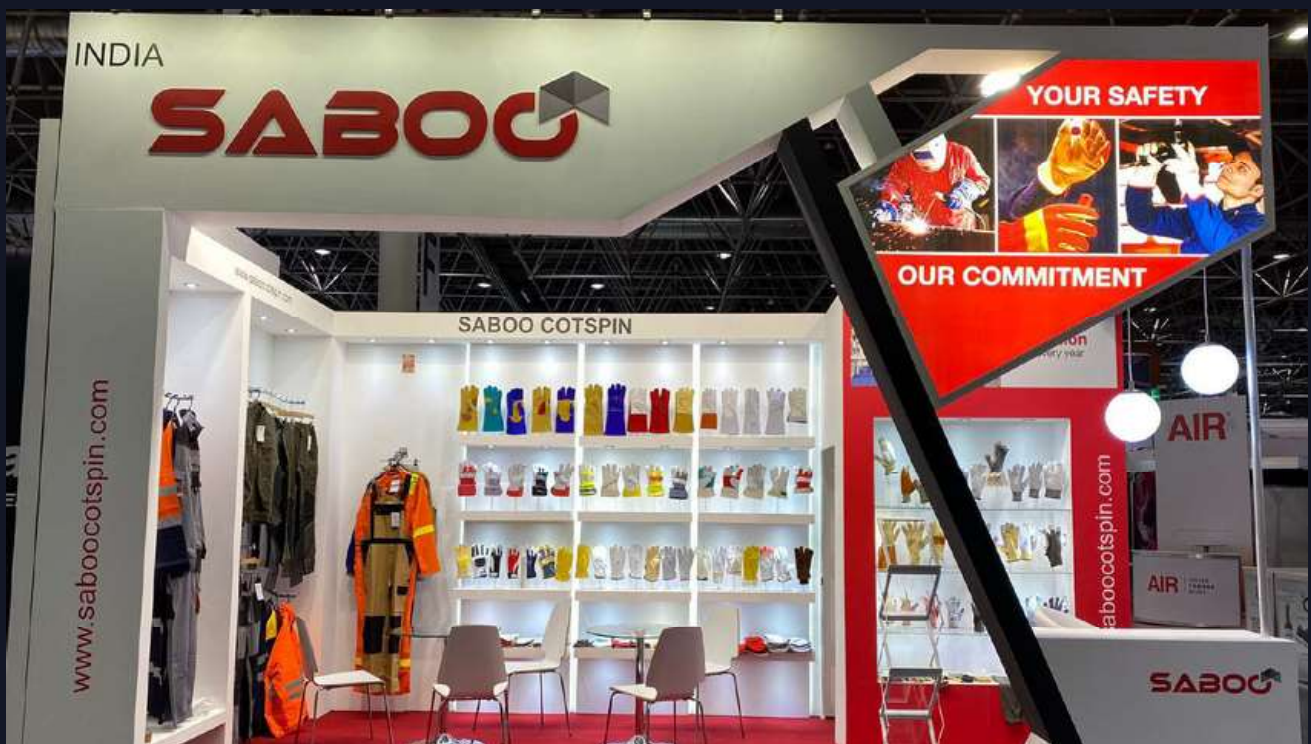
SABOO COTSPIN EIMA INTERNATIONAL 2021 BOLOGNA ITALY