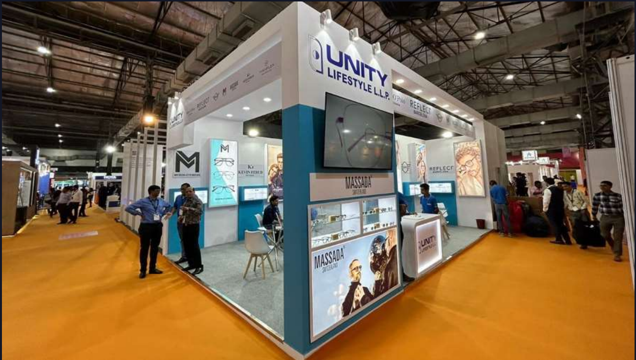
UNITY LIFESTYLE L.L.P. OPTICAL FAIR 2023, MUMBAI, INDIA