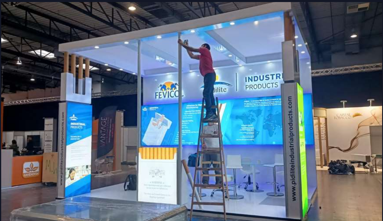
PIDILITE INTERTABAC, GERMANY 2022