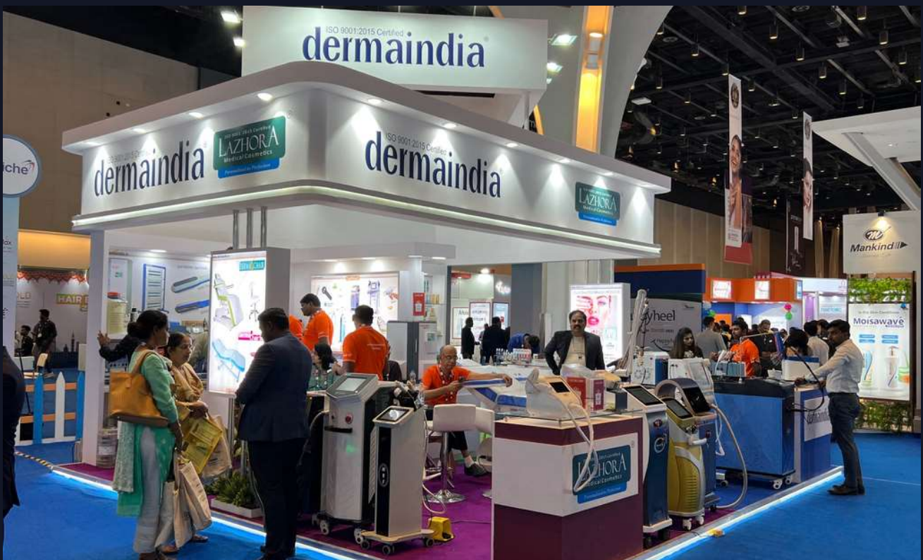
DERMAINDIA DERMACON 2023, MUMBAI, INDIA