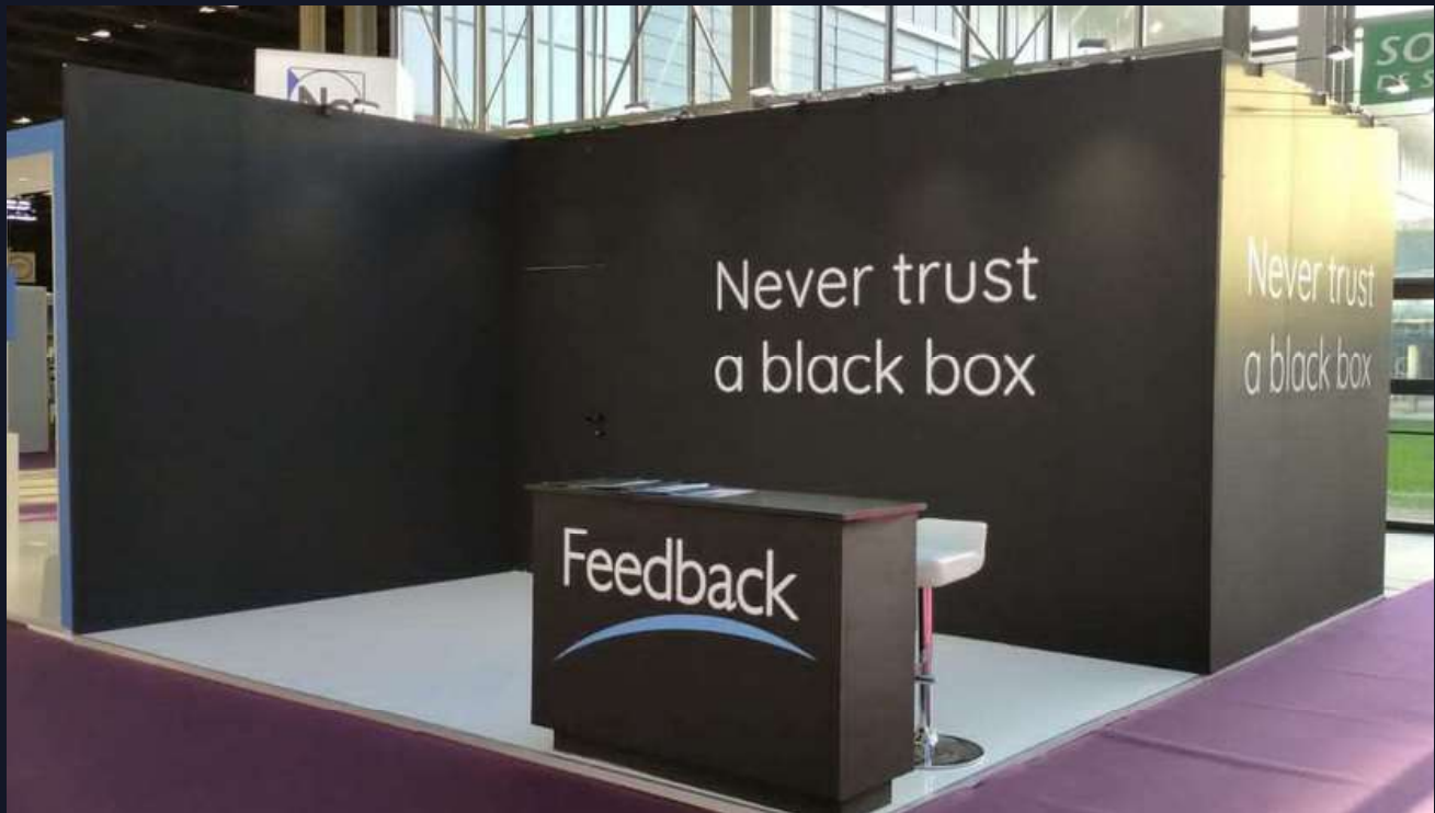
FEEDBACK ITALIA SRL MILIPOL 2021 PARIS FRANCE